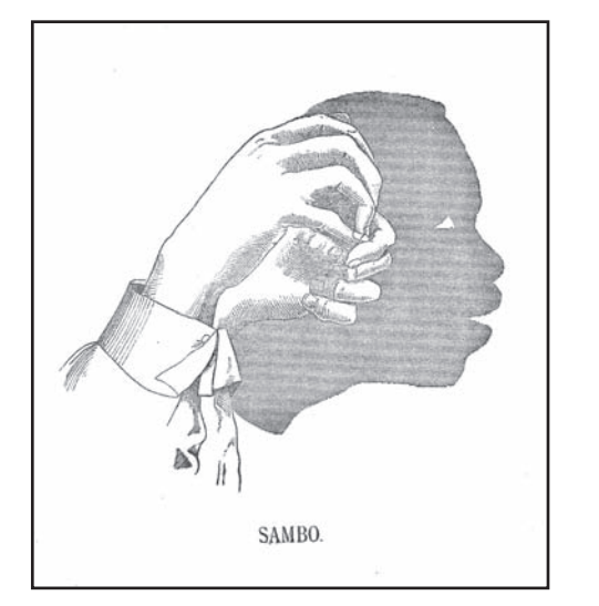
10. (Juvenile). HAND SHADOWS ON THE WALL . NP, Pastime Publishing, c. 1880. Twelve cards printed on both

sides, housed in a two-part box. Each card measures 6 by 7 1/4 inches (154 x 185 mm). The cards show hand positions for the formation of shadow figures and include instructions on how to cast Sambo, Washington, and Shakespeare, in addition to old favorites such as a rabbit, a bird in flight, and a dog. These cards are identical to those found in a rather uncommon book of the same title by Henry Bursill, which first saw publication in England around 1879. The English version substitutes Wellington for Washington. This version, which may have been conceived as a sort of parlor game, is unrecorded. The original publisher's box, which has the title, price, and publication information on the upper cover and contents printed on the lower cover, lacks its sides and shows some light soil and wear. Contents are clean and about fine. $950