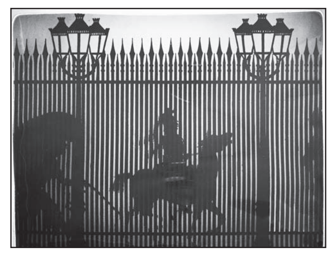
13. (Juvenile). L'OMBRO-CINÉMA. (Paris, Saussine, c. 1910). This colorful French animated shadow theater, or Ombro-Cinéma, pays tribute to the silver screen. A sheet of acetate printed with vertical, black bars in the design of a fence and lamp posts is set into a wooden paper-covered box, illustrated with a chromolithographic proscenium. Charlie Chaplin, in the role of the Little Tramp, stands to one side of the stage with his bowler hat jauntily askew, and Fatty Arbuckle stands to stage right. A scroll printed with a panorama fits into the back of the box. The operator winds the scroll from one side to the other using a small crank. As the panorama passes by behind the acetate, the black bars align with parts of each illustration to animate the images. Scrolls for the theater are interchangeable. This set includes two black & white scrolls: "Film No. 1, Scènes des rues," featuring the comic antics of drivers and pedestrians on the street, and "Film No. 7, Au Cirque," depicting high-wire walkers, acrobats, elephants, and other daring circus acts. Housed in the original chromolithographed box, which bears the same illustration as the proscenium but with a silhouetted scene in the center. Affixed to the inside of the lid are the publisher's printed instructions and a list of other scrolls available for the theater. Box measures 17 7/8 by 12 7/8 inches (454 x 327 mm). Slight split starting along one edge of the box, a few short marginal tears to the scroll "Film No. 1," else a fine, working example of this optical toy. $2,250