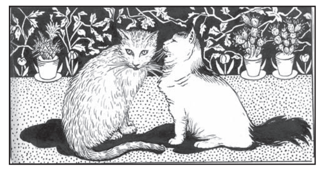
LOTI, PIERRE. Lives of Two Cats. Boston, (Riverside 19. Press), 1900. Octavo. (iv), 92pp. Although not stated, this is one of 250 copies printed, of which 150 were for sale. Illustrated with eight black & white drawings by C. E. Allen. The scenes of the titular two cats include a moment of relaxation by the fireside, an altercation with a neighboring cat, and an encounter with a tortoise. Laid into this copy is the original penand-ink artwork for the illustrations and cover, in addition to proofs for all illustrations except the cover. Not much is known about Allen, whose illustrations show great technical competence. The original advertisement called the book "a charming translation of a literary gem," and it is sure to delight ailurophiles and bibliophiles alike. Light offsetting to title page, else a remarkably fine copy in publisher's green cloth, gilt-stamped, with original glassine dust wrapper. T.e.g. $2,750

often young women depicted in soft, pastel colors, as in this book. The illustrations accompany a selection of the best short stories written by Mansfield throughout her career. Bound in paste-paper-covered boards with a gilt-stamped cloth label on spine. Scattered foxing, minimally affecting a few plates, else about fine in printed dust wrapper, which is lightly toned and has a small crease at spine. Housed in a numbered slipcase that shows wear to spine ends. $1,650