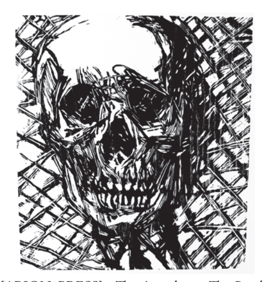
[ARION PRESS]. The Apocalypse: The Revelation of 1. Saint John the Divine. The Last Book of the New Testament from the King James Version of the Bible, 1611, with Twenty-Nine Prints from Woodblocks Cut by Jim Dine. San Francisco, 1982. Folio. (64)pp. One of 150 copies signed by Jim Dine, the illustrator, and Andrew Hoyem, the printer. Dine's riveting expressionistic woodcuts depict objects and characters in Revelations, such as a skull, a cloud, the Beast, the serpent, and a two-page spread of angel's wings. The text is set in Garamond, with the voices of God and the angels distinguished by type size. To ensure that the pages would lie flat, Andrew Hoyem himself sewed the signatures concertina-style over a flexible core of plastic and nylon fiber. The binding is quarter-inch laminated oak boards with a lightening-bolt device by Dine, backed in white alum-tawed pigskin. One of the major artist's books of our time, drawing on a long tradition of illustrated Apocalypses, from Dürer to the present. Nearly imperceptible toning to spine, else a fine copy. Prospectus laid in. $8,500